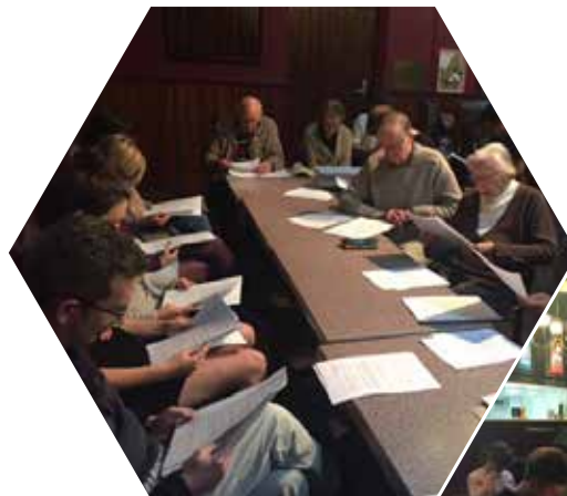
A great turn out for the 'Pygmalion' information session