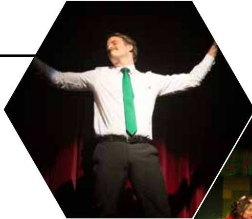
Lively scenes from Limelight's recent production of 'Greenwicks'

Between performances of Greenwicks , rehearsals for Let the Sunshine and information sessions and auditions for Pygmalion and The Wedding Singer , it's been a busy month at the Limelight! Here are some behind the scenes snaps of what's been going on at the theatre in June and July.